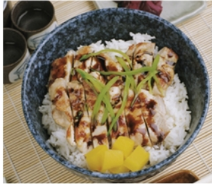
3. TORI DON $8.00 grilled chicken with teriyaki sauce on rice with one bowl of free miso soup