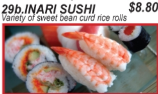
29b. INARI SUSHI $8.80 (4pcs) Variety of sweet bean curd rice rolls