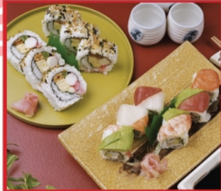
30a. HANA MAKI $7.80 Inside out roll with crabmeat, shred pork, egg, cucumber, mushroom, bean