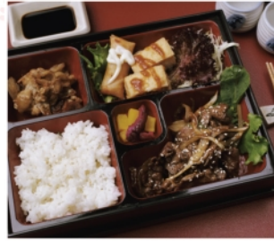
9. SUKIYAKI BENTO $10.80 sukiyaki beef, pork shogayaki, tofu, harumaki served in traditional Japanese meal box with one bowl of free miso soup