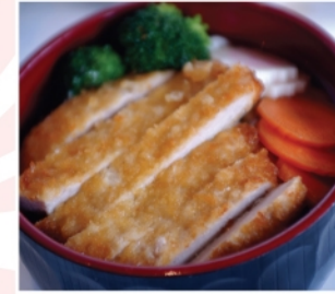
18. TONKATSU RAMEN $8.80 deep fried crumbed pork fillet in thin noodle soup