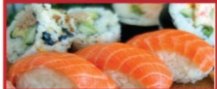
31a. THE DREAM TEAM $9.80 Our selection of nigiri sushi, California rolls & hosomaki