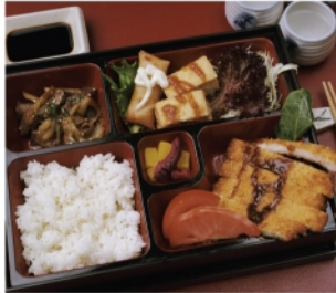
8. TONKATSU BENTO $10.80 deep fried crumbed pork, wafu beef, tofu, harumaki served in traditional Japanese meal box with one bowl of free miso soup