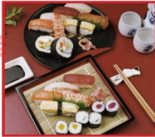
26a. DELUX SUSHI $8.80 Nigiri sushi & California rolls mixed 26b. ASSORTED SUSHI $7.50 Nigiri sushi & hosomaki mixed