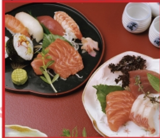
28a. MORIAWASE $10.80 a combination of sushi & sashimi 28b. SASHIMI $8.80 Fresh raw fish slices served with wasabi & soya