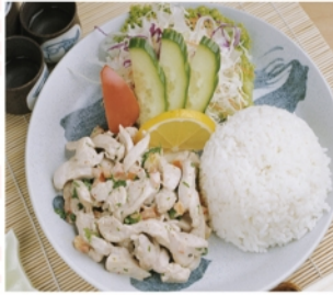
2. TORI GARLIC YAKI RICE $8.00 chicken fillet cooked in special chilli & garlic cream sauce on rice with one bowl of free miso soup