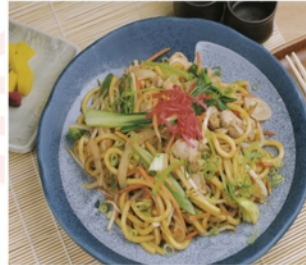
15. YAKI SOBA $8.50 stir fried chicken & veggies with thin noodle and miso soup