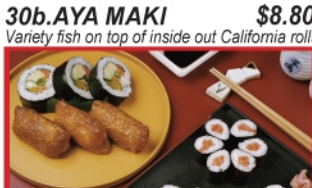
30b. AYA MAKI $8.80 Variety fish on top of inside out California rolls