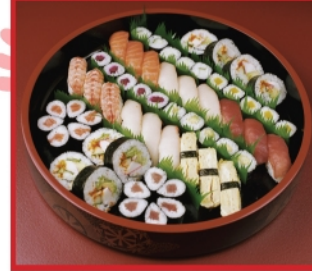
36. MAKI PLATTER 48pcs $32 64pcs $38 80pcs $45