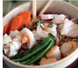
16. KAISEN RAMEN $9.80 assorted seafood in thin noodle soup