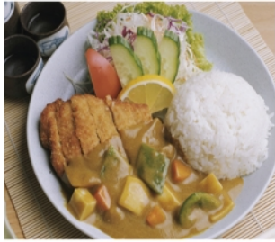
1. KATSU CURRY RICE $8.00 deep fried pork fillet in curry sauce on rice with one bowl of free miso soup