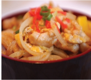
4. OYAKODON $8.00 chicken, egg and onion with special sauce on rice with one bowl of free miso soup