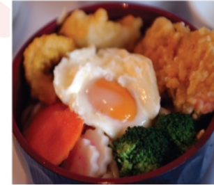
20. NABEYAKI UDON $9.50 tempura prawn, chicken, vegetables & egg in thick noodle soup