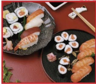
25a. MIX SUSHI $7.50 Nigiri sushi & assorted slices hand rolls 25b. SALMON SUSHI $7.50 Salmon nigiri sushi & small salmon seaweed rolls