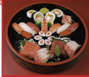
35. HOUSE SPECIAL 36pcs $38