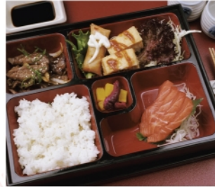
11. SASHIMI BENTO $11.80 sashimi, misoyaki beef, tofu, harumaki served in traditional Japanese meal box with one bowl of free miso soup