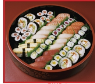
34. COMBINATION SUSHI PLATTER 36pcs $28 48pcs $36 64pcs $48