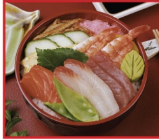
33. CHIRASHI $8.80 Sliced raw fish, prawn omelette, mushroom, shred fish & pickles over sushi rice