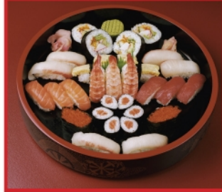
37. SUSHI COMBO 32pcs $32