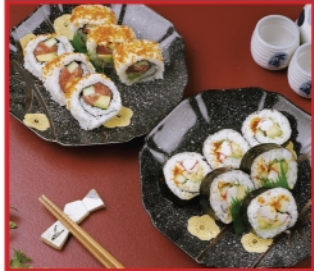
27a. SPICY SALMON ROLL $7.80 (6pcs) Inside out roll with salmon, avocado, cucumber & chili mayonnaise 27b. CALIFORNIA ROLL $6.80 (6pcs) Crabmeat, avocado, flying fish roe, lettuce and cucumber seaweed roll