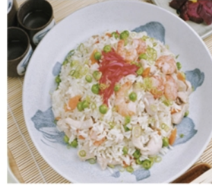
14. YAKI MESHI $6.50 Japanese style fried rice (chicken and prawn) with one bowl of free miso soup