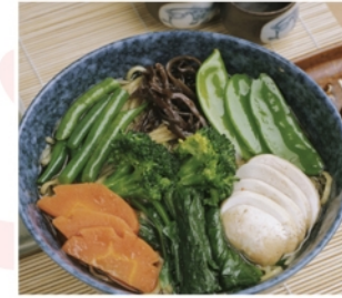
17. YASAI RAMEN $7.00 seasonal vegetable in thin noodle soup