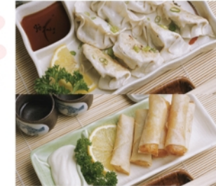
23a. GYOZA $6.50 pan fried Japanese style dumpling