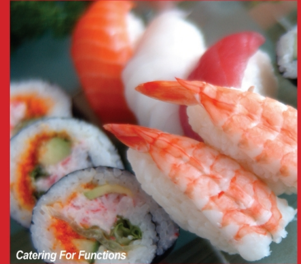
Catering For Functions

Geelong's renowned Japanese restaurant serving high quality sushi through to soup noodle with soup stock cooked for hours.