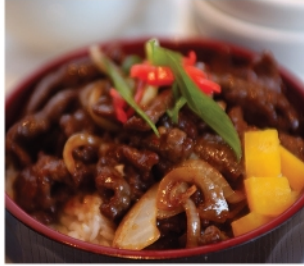
6. GYUDON $8.00 sliced beef & onion on rice with one bowl of free miso soup