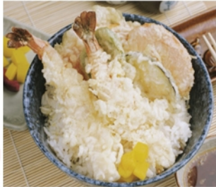
7. TENDON $8.80 tempura prawn and vegetables on rice with one bowl of free miso soup