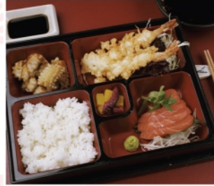
13. KAISEN BENTO $12.80 sashimi, pan fried fish & squids, tempura prawn served in traditional Japanese meal box with one bowl of free miso soup