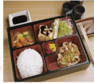
10. TORI BENTO $10.80 teriyaki chicken, curry beef, tofu, harumaki served in traditional Japanese meal box with one bowl of free miso soup