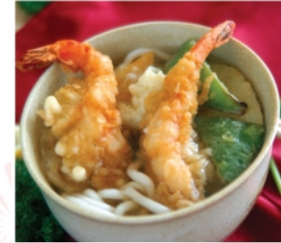
19. TEMPURA UDON $9.00 deep fried prawn & vegetables in thick noodle soup