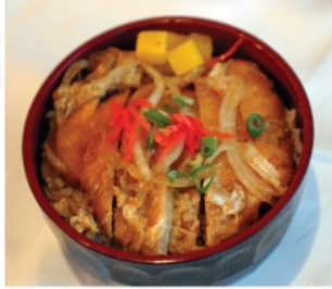
5. KATSU DON $8.00 Crumbed pork cooked with onion & egg on rice with one bowl of free miso soup