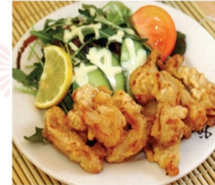
24. TATSUTA AGE $6.50 Deep fried marinated chicken served with salad