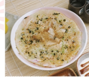
22. OKONOMI YAKI $5.80 Japanese style seafood and vegetables pancake