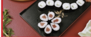
32a. SAKUROKU $6.50 Futo maki & inani mixed