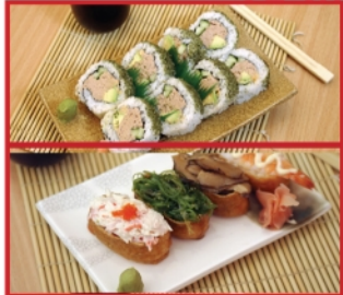
29a. SPICY COOKED TUNA ROLL $8.80 (6pcs) Inside out rolls with cooked tuna, avocado, cucumber & chili mayonnaise