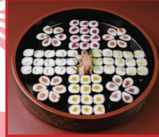
38. HOSO MAKI PLATTER 64pcs $26 80pcs $32 96pcs $38