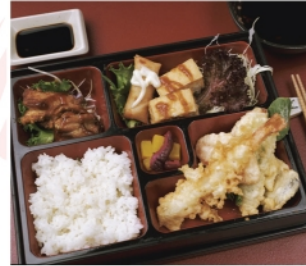
12. TEMPURA BENTO $11.80 assorted tempura chicken karage, tofu, harumaki served in traditional Japanese meal box with one bowl of free miso soup