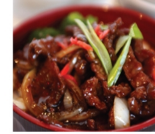
21. NIKU UDON $5.80 sliced beef & onion in thick noodle soup