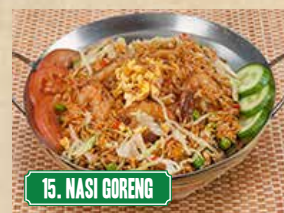
15. NASI GORENG