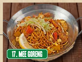
17. MEE GORENG