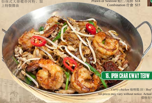
16. IPOH CHAR KWAY TEOW