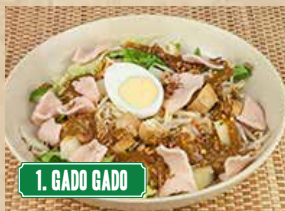
1. GADO GADO

Vegetable & tofu salad served with peanut sauce. 混合蔬菜和豆腐配上特製的花生醬