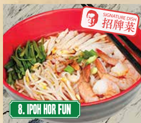
8. IPOH HOR FUN