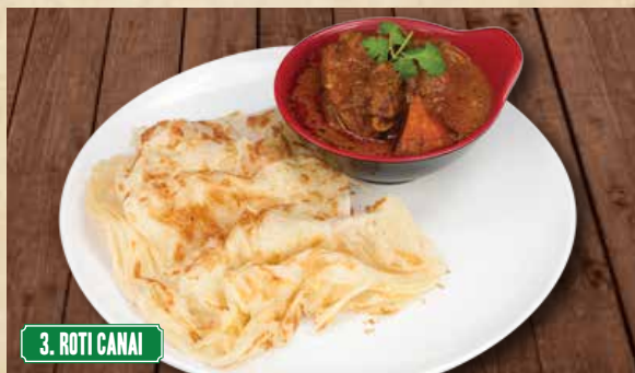
3. ROTI CANAI