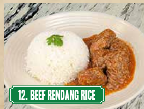
12. BEEF RENDANG RICE