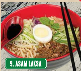
9. ASAM LAKSA