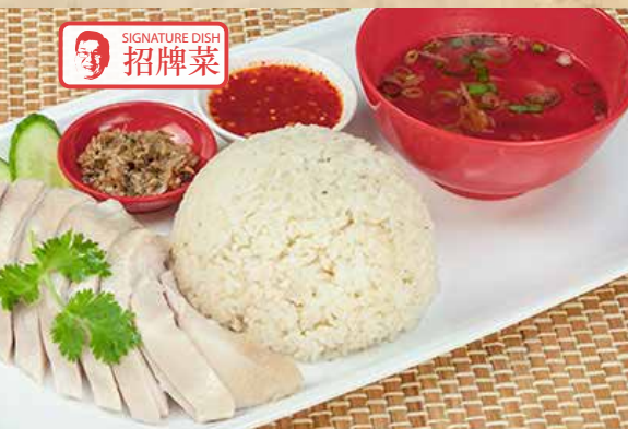
SIGNATURE DISH 招牌菜

11. Hainanese Chicken Rice $12 海南雞飯 Boneless poached chicken with steamed rice cooked in our special home-made chicken, ginger paste and served with vegetable soup. 特式油飯配上鮮美幼滑的去骨白斬雞，再加上一碗蔬菜湯