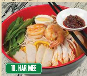
10. HAR MEE