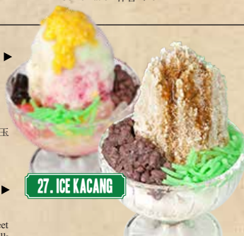
27. ICE KACANG