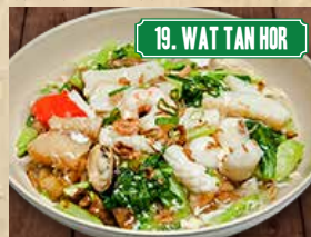
19. WAT TAN HOR