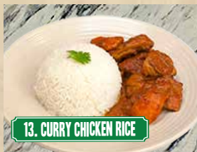
13. CURRY CHICKEN RICE