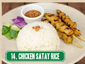
14. CHICKEN SATAY RICE