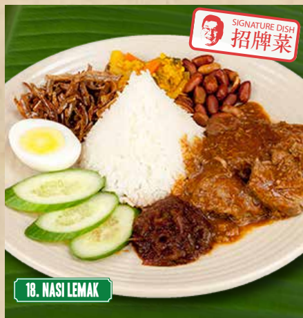
18. NASI LEMAK