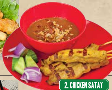
2. CHICKEN SATAY