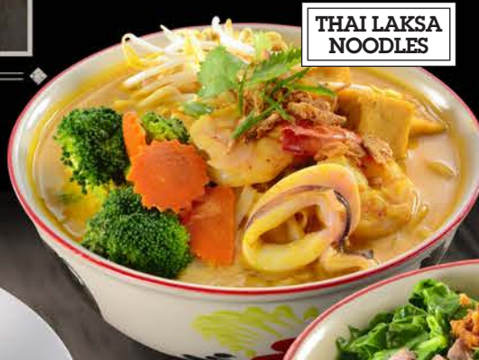
THAI LAKSA NOODLES