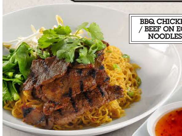
BBQ CHICKEN / BEEF ON EGG NOODLES