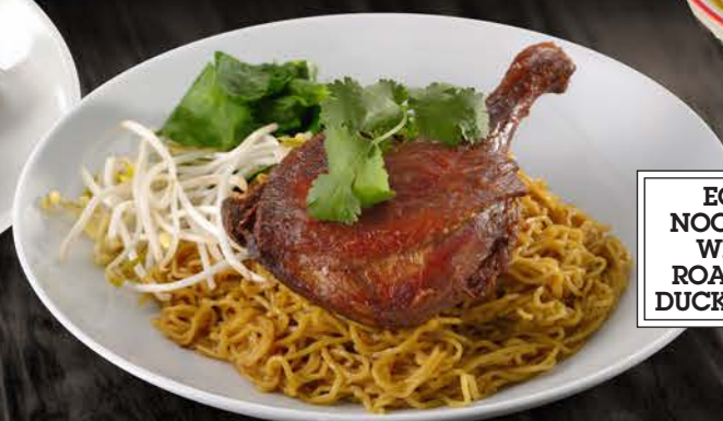
EGG NOODLES WITH ROASTED DUCK (DRY)