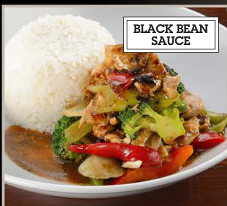
BLACK BEAN SAUCE