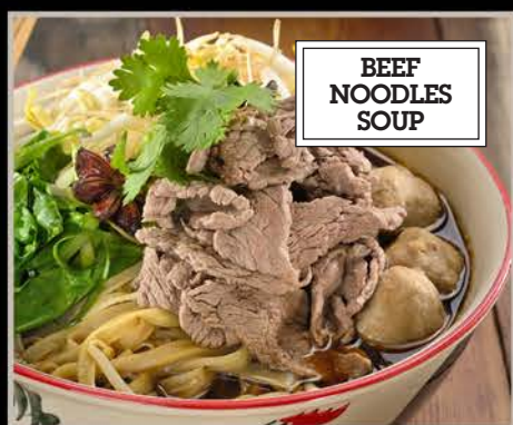
BEEF NOODLES SOUP