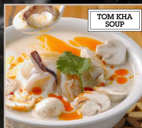
TOM KHA SOUP

SOUP DISHES SERVED WITH STEAMED RICE OR ROTI