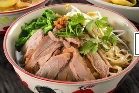
DUCK NOODLES SOUP