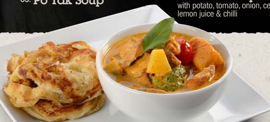
RED CURRY WITH ROTI