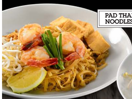
PAD THAI NOODLES