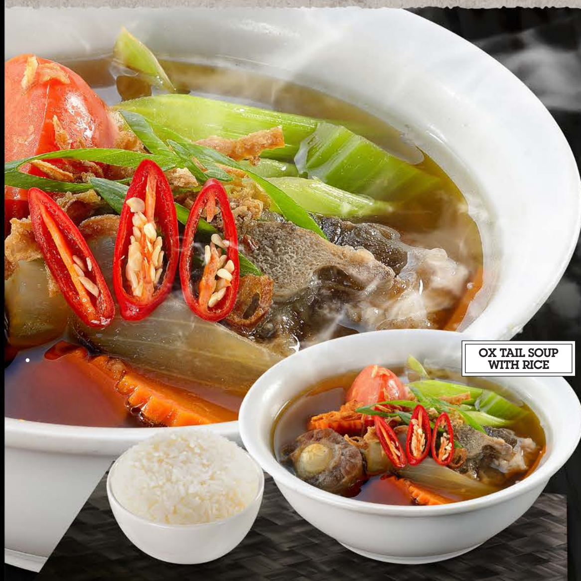
OX TAIL SOUP WITH RICE