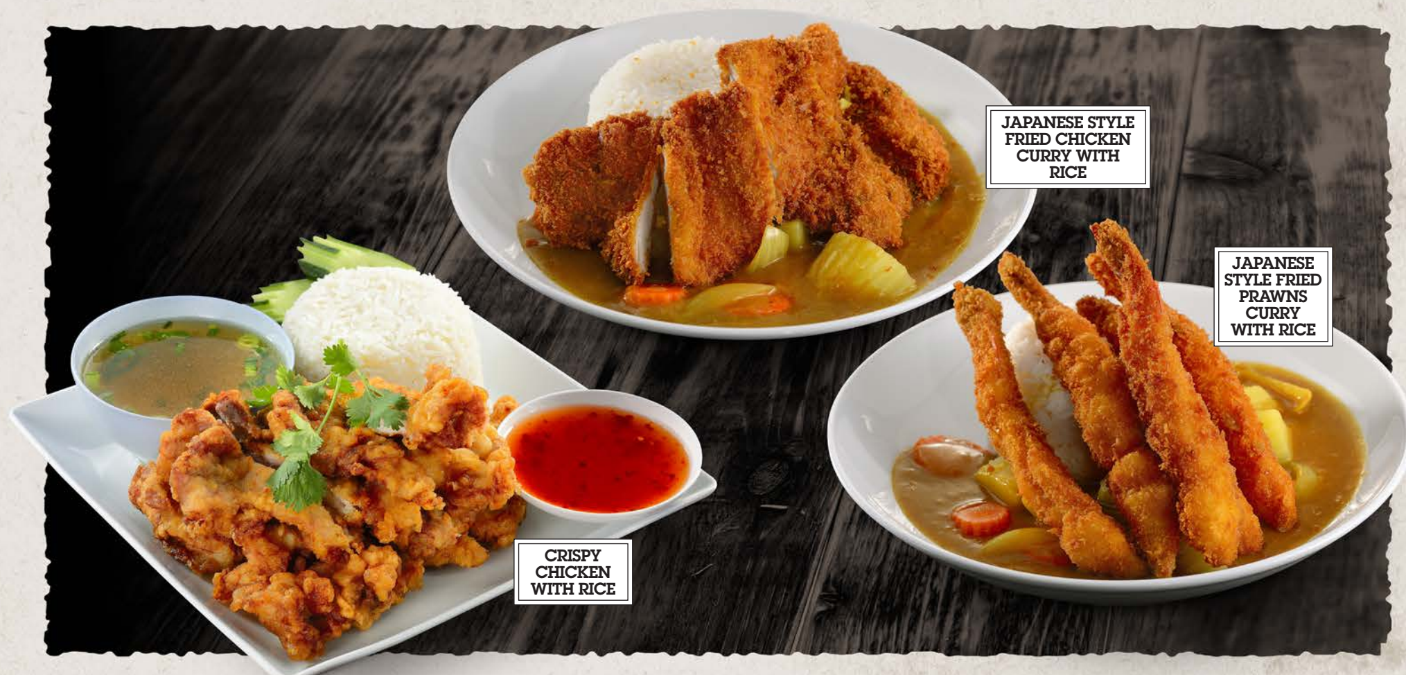
JAPANESE STYLE FRIED CHICKEN CURRY WITH RICE