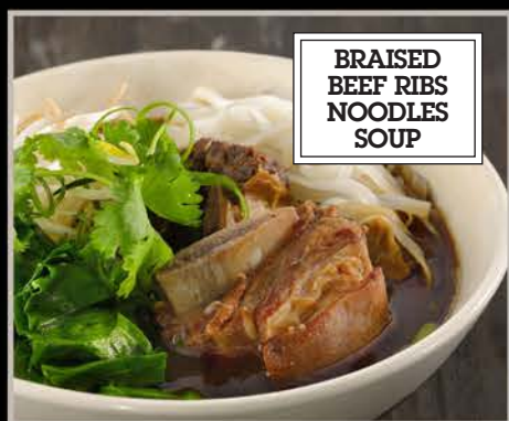
BRAISED BEEF RIBS NOODLES SOUP