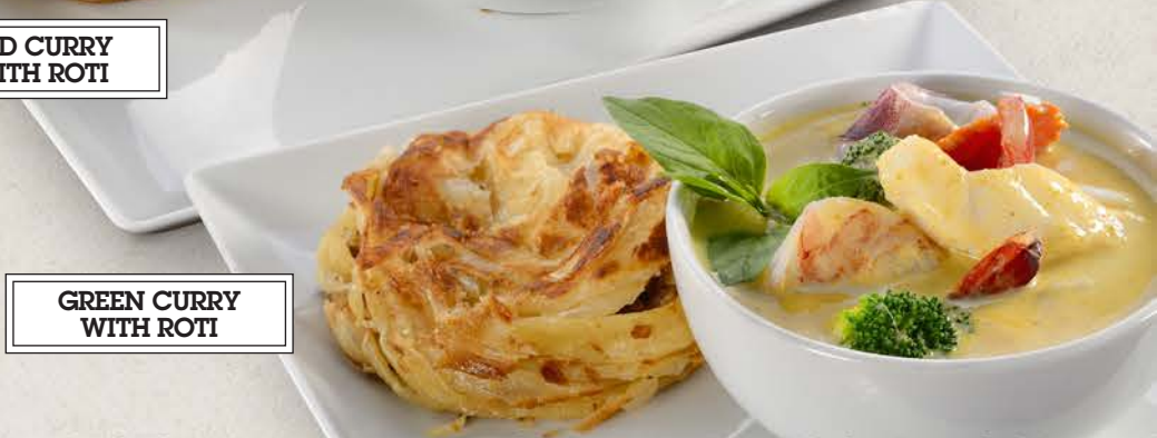
GREEN CURRY WITH ROTI