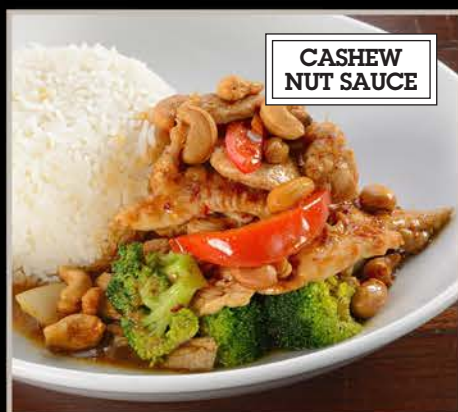
CASHEW NUT SAUCE

ANY DISHES WITH PLAIN FRIED RICE . . . . . ADD $4