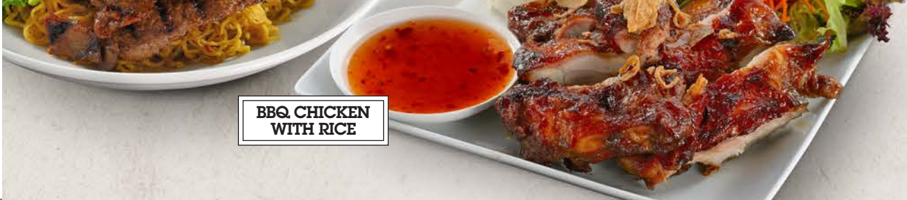
BBQ CHICKEN WITH RICE