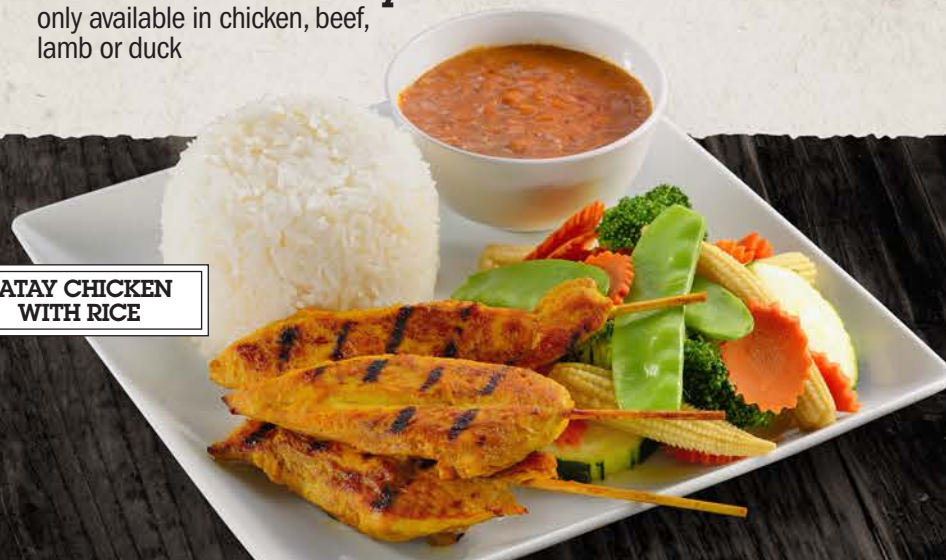
SATAY CHICKEN WITH RICE