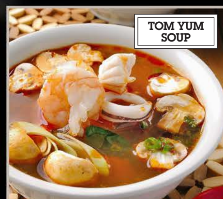
TOM YUM SOUP