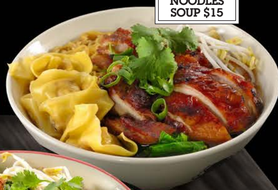
BBQ CHICKEN & WONTON NOODLES SOUP $15