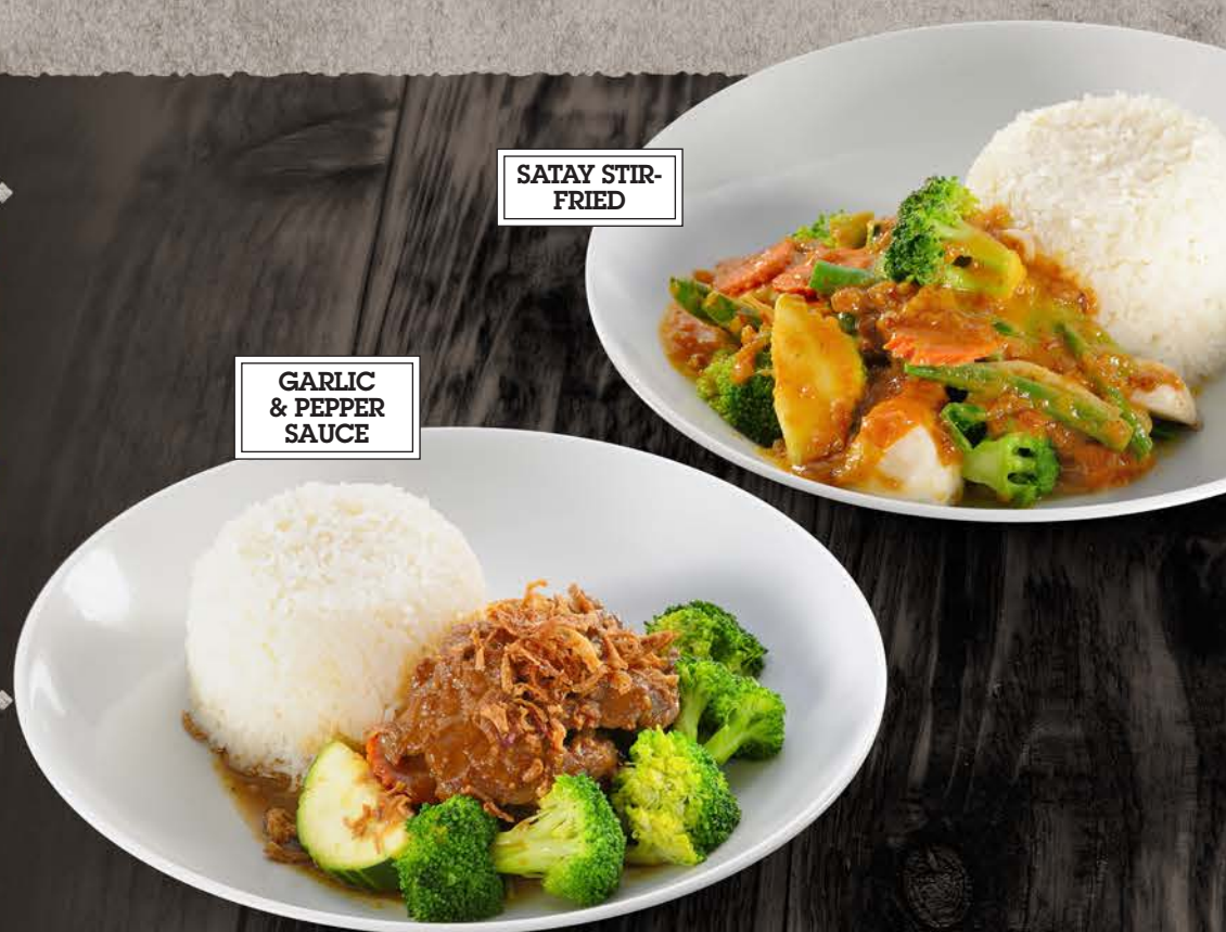
SATAY STIR- FRIED