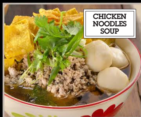
CHICKEN NOODLES SOUP