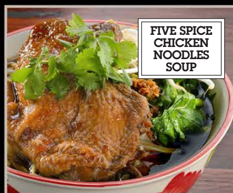
FIVE SPICE CHICKEN NOODLES SOUP