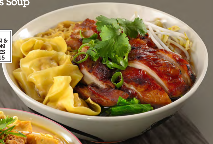
BBQ CHICKEN & WONTON NOODLES SOUP $15