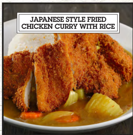
JAPANESE STYLE FRIED CHICKEN CURRY WITH RICE