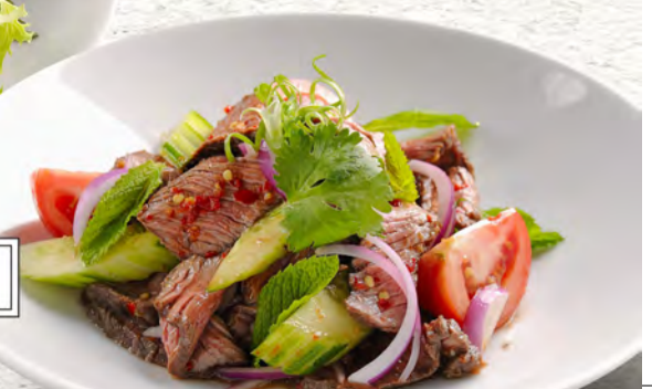
THAI BEEF SALAD