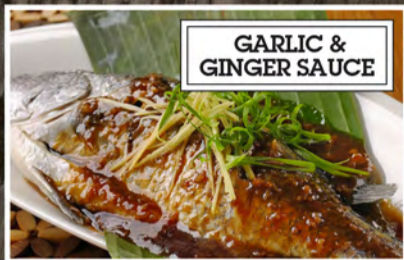
GARLIC & GINGER SAUCE