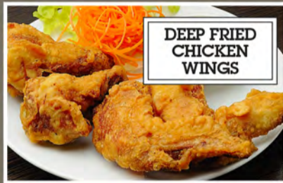
DEEP FRIED CHICKEN WINGS