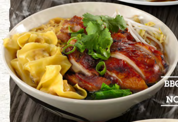
BBQ CHICKEN & WONTON NOODLES SOUP