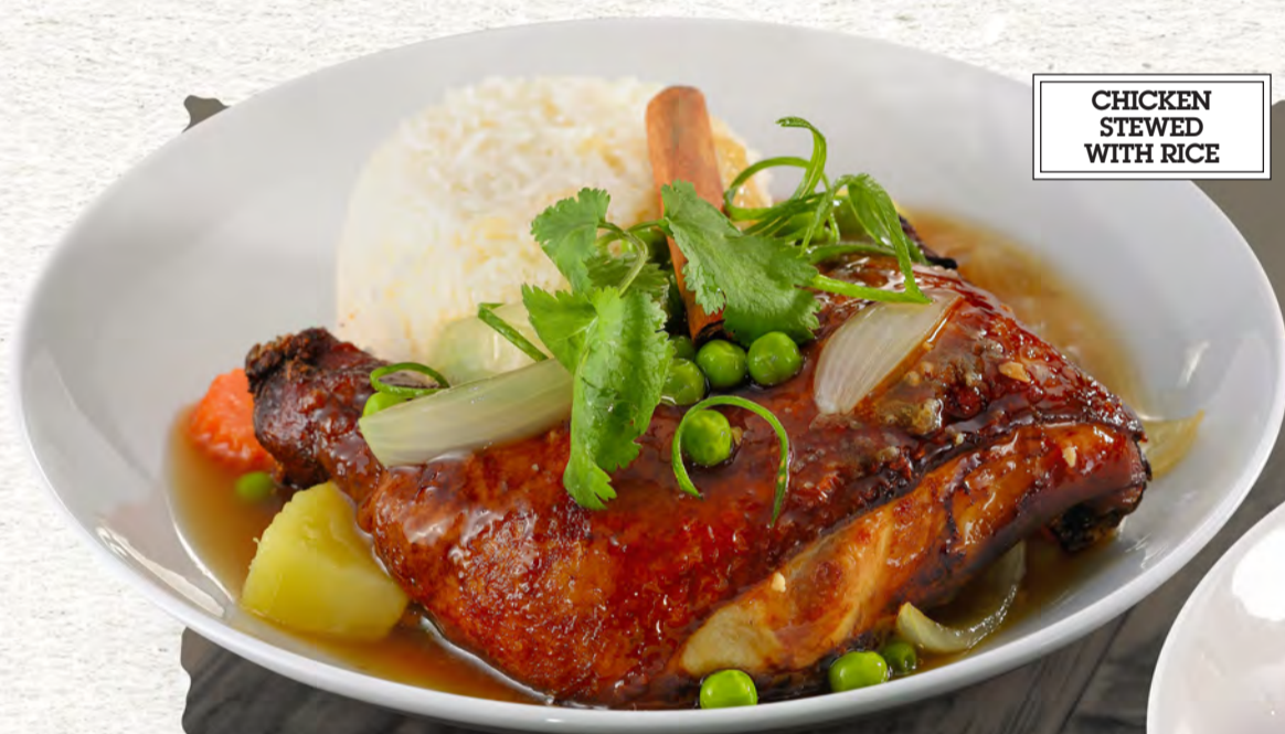
CHICKEN STEWED WITH RICE