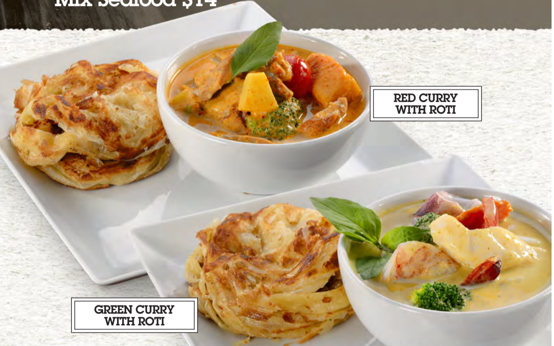
RED CURRY WITH ROTI