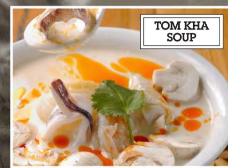
TOM KHA SOUP