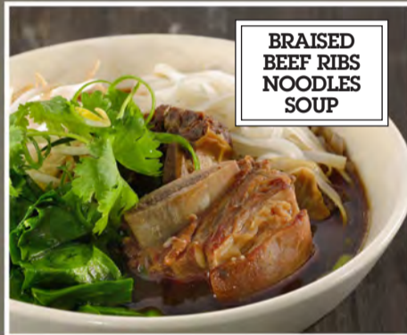
BRAISED BEEF RIBS NOODLES SOUP