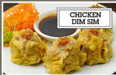
CHICKEN DIM SIM