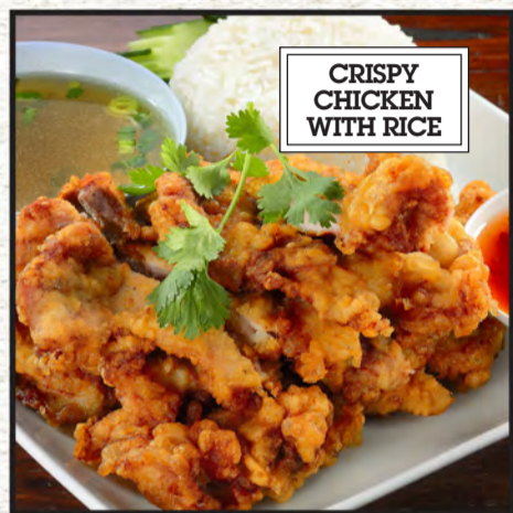
CRISPY CHICKEN WITH RICE