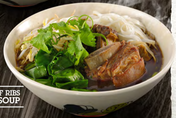
BRAISED BEEF RIBS NOODLES SOUP

HEAT INDICATOR : ! Mild - !! Medium - !!! Hot