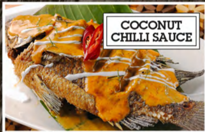
COCONUT CHILLI SAUCE