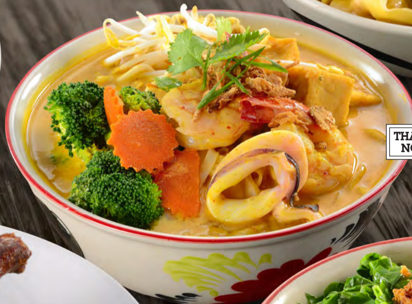
THAI LAKSA NOODLES