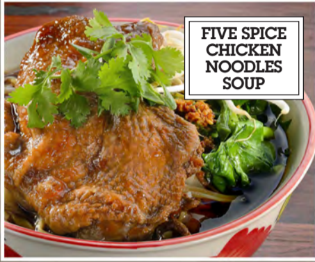
FIVE SPICE CHICKEN NOODLES SOUP