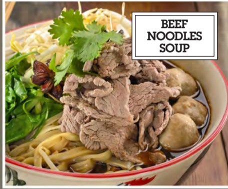
BEEF NOODLES SOUP