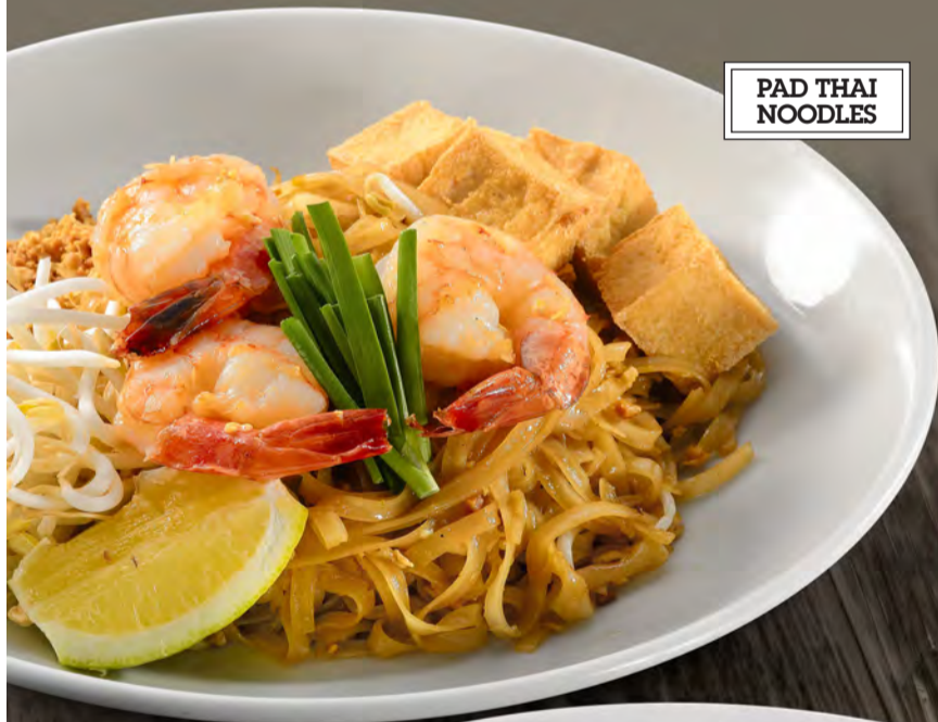
PAD THAI NOODLES