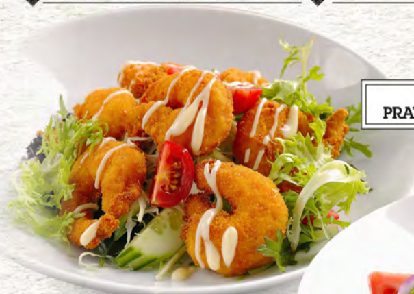
CRISPY PRAWN SALAD