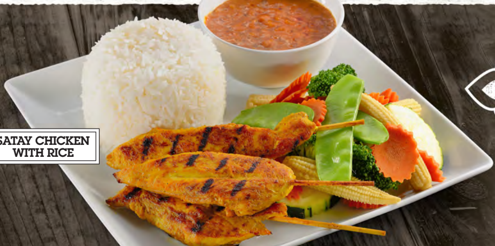
SATAY CHICKEN WITH RICE