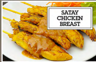
SATAY CHICKEN BREAST