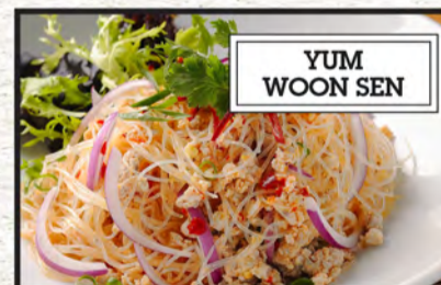
YUM WOON SEN