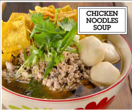
CHICKEN NOODLES SOUP