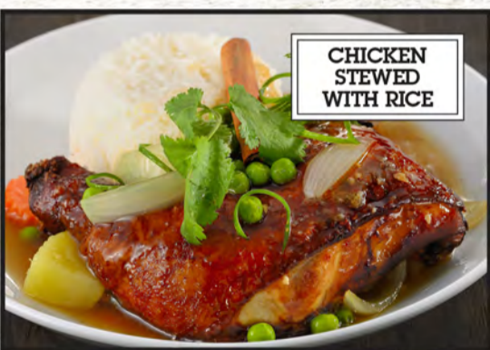
CHICKEN STEWED WITH RICE