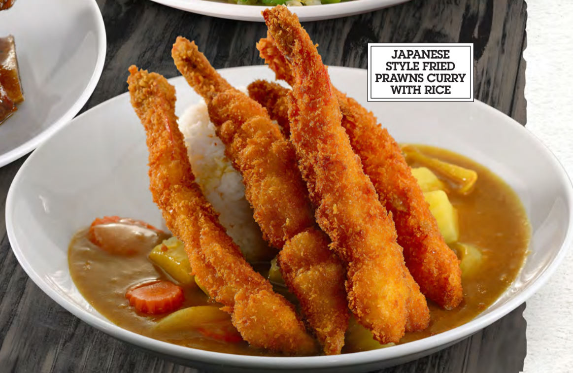
JAPANESE STYLE FRIED PRAWNS CURRY WITH RICE