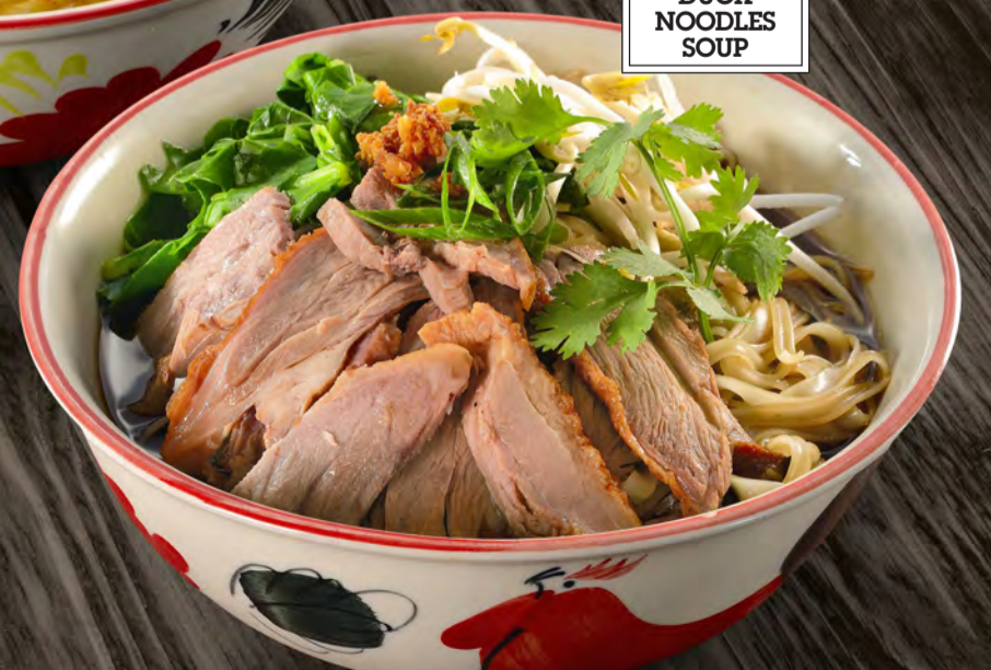
DUCK NOODLES SOUP