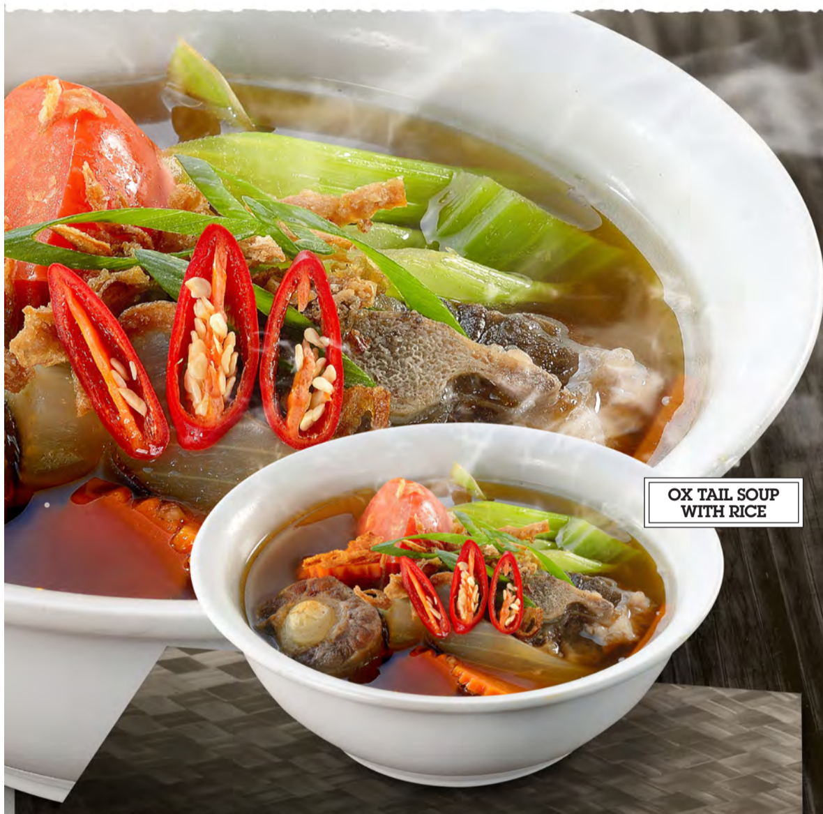
OX TAIL SOUP WITH RICE