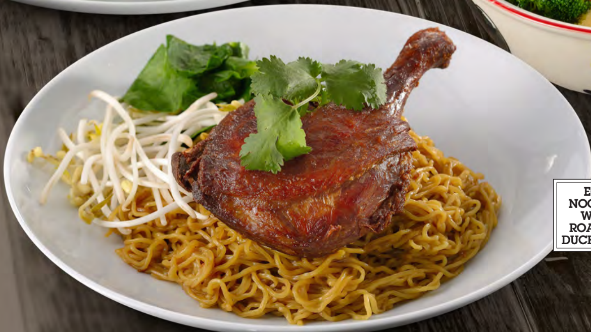
EGG NOODLES WITH ROASTED DUCK (DRY)