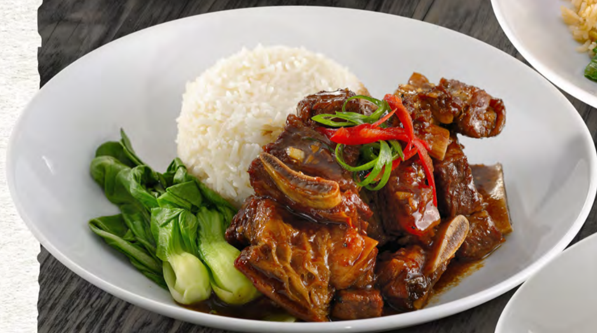
BRAISED BEEF RIBS with Rice