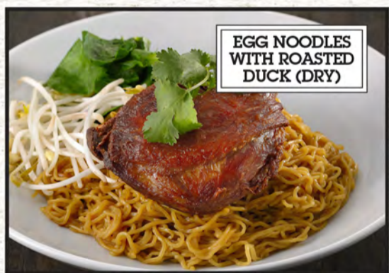
EGG NOODLES WITH ROASTED DUCK (DRY)