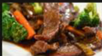
301. Black Bean Beef $15.80