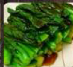
703. Chinese Kalo with Oyster Sauce $10.80