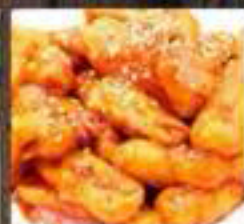
711. Crispy Sweet and Sour Eggplant $14.80