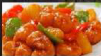
501. Sweet and Sour Pork with Pineapple $15.80