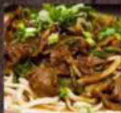
904. Stir & Mix Hand-pulled Noodles with BBQ Lamb $12.80