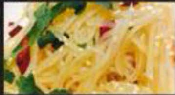
104. Potato Silk with Sauce $6.80