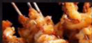
801. Lamb Skewers (5)