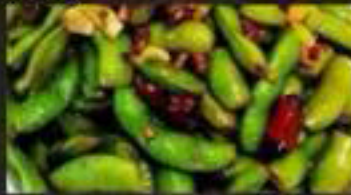
105. Specy Soy Bean $6.80