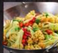
706. Griddled Cauliflower $13.80