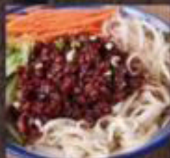
908. Hand-pulled Noodles With Bean Paste $11.80