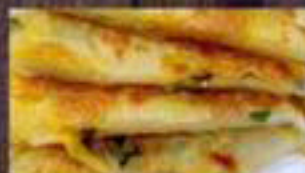
1105. Onion Pancake $6.80