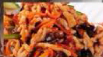
502. Stir-fried Shredded Pork with Sweet and Sour Garlic Sauce $15.80