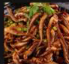
602. Squid Tentacles Teppanyaki $15.80