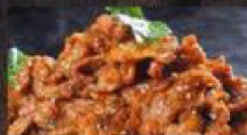
402. Stir-fried Cumin Lamb $16.80