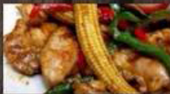
207. Satay Chicken $15.80