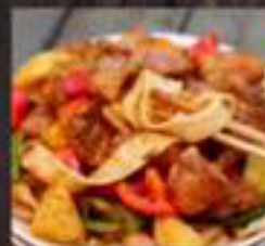
901. Stir & Mix Hand-pulled Noodles with Spicy Chicken (4 ppl) $29.80