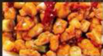
202. Kong Po Chicken Fillet $15.80