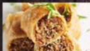
1104. Cumin Lamb Rolls $9.80