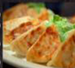
1006. Pan-Fried Lamb & Onion Dumplings $11.80