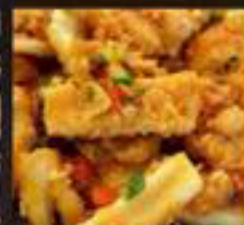
603. Salted Egg York Squid $16.80