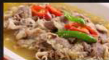
303. Sour and Spicy Sliced Beef $18.80