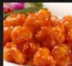
604. Sweet and Sour Prawns with Pineapple $22.80