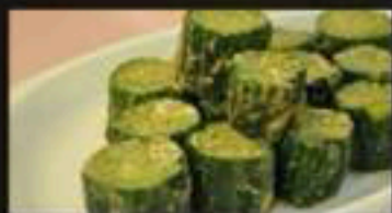
101. Cucumber Mustard $7.80