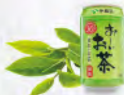
• OCHA 3.8