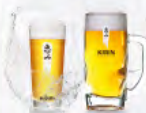
KIRIN MEGUMI BEER 麒麟恵みビール 8.0 / 9.5

Kirin's special 'First Press' method produces pure, smooth flavours and a pale amber shine, crowned with a rich, creamy head. Only the first mix of malt and water is extracted when ingredients are at their purest to deliver what in Japan is considered a blessing.