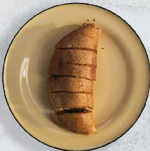
martabak - $8.50