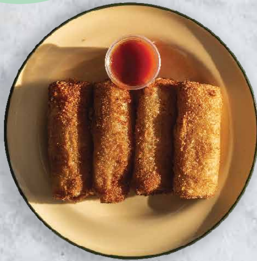
risoles - $10