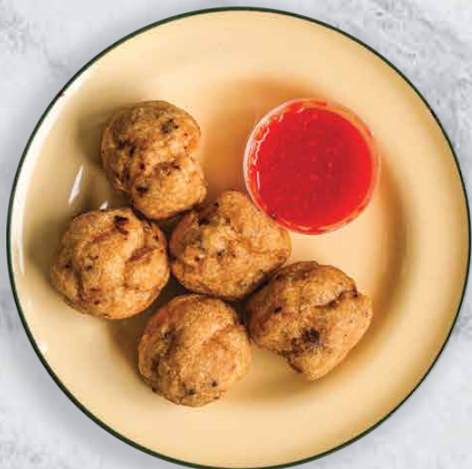
bakso goreng - $8.50