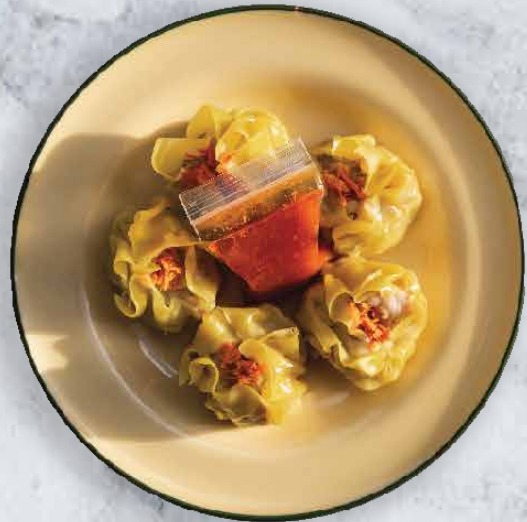
siomay - $10