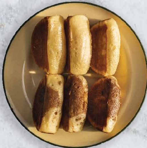
pukis - $8.50