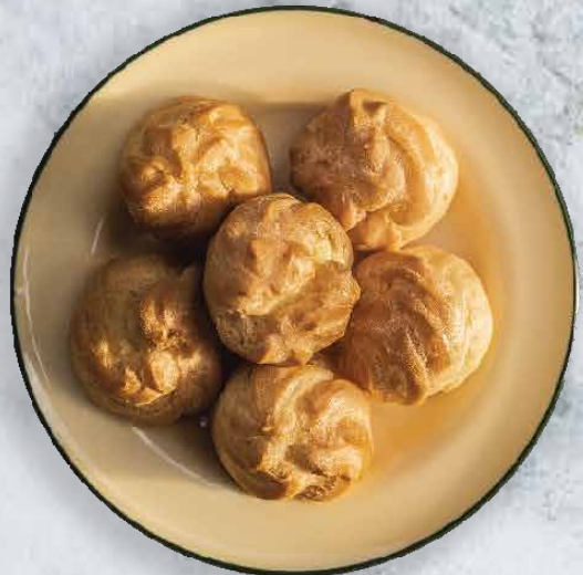
kue sus - $8