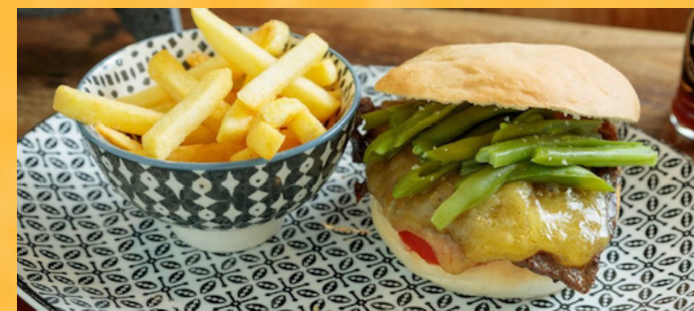
CHACARERO SANDWICH Voted No.1 Sanga in Melbourne by 3AW