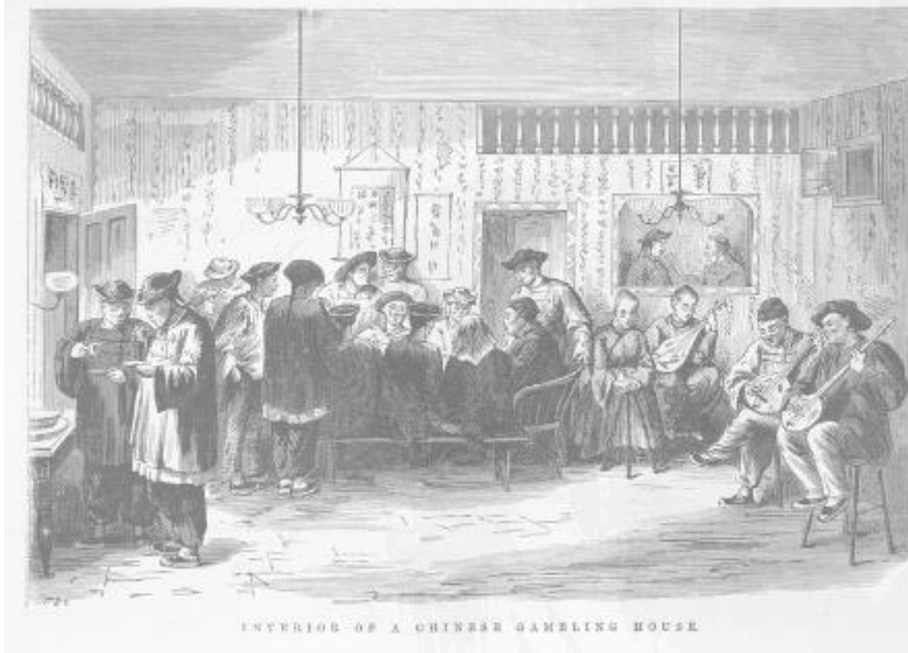
Interior of a Chinese gambling house, 1871. Wood engraving published in the Illustrated Australian News for Home Readers. State Library of Victoria