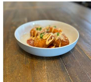
GARLIC PRAWN $18

Filled with house made creamy mushrooms. On a bed of our house made Arrabbiata sauce