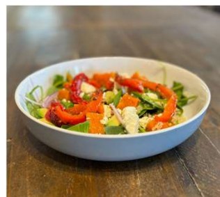
PUMPKIN & QUINOA $24 Roasted pumpkin with quinoa, spinach, feta, avocado, sun dried tomatoes with a lemon, olive oil and garlic dressing.