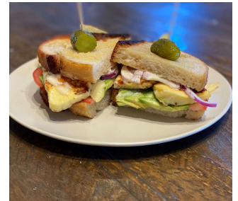
HALOUMI $25 Pan fried haloumi, with fresh avocado, tomato and red onion. Served with crisps and pickle.