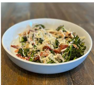
ROASTED BROCCOLI $24 Oven roasted broccoli, diced fried bacon and shallots with fresh grated parmesan and feta.