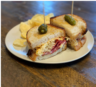
RUEBEN $25 Local SA sourced corned beef grilled with Swiss cheese and topped with sauerkraut. In toasted sourdough. Served with crisps and pickle.