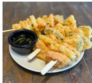
TEMPURA VEG (3) $20

House made crispy fried chicken. Skewered and served with a drizzle of our house made spicy aioli