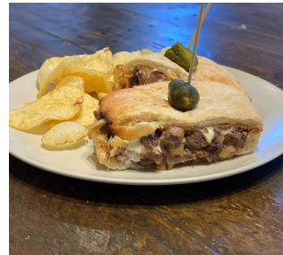
PHILLY CHEESESTEAK $25 Local SA rump steak. Grilled and mixed with onion and melted cheese. Served in a fresh roll with crisps and pickle.