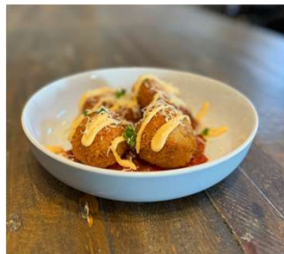
MAPLE BACON $18

Filled with oven roasted pumpkin drizzled with honey. On a bed of our house made Arrabbiata sauce