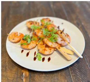
GARLIC PRAWN (3) $20

Locally sourced fresh tiger prawns. Pan fried in butter with garlic. Served with a drizzle of our house made Sweet Chili sauce