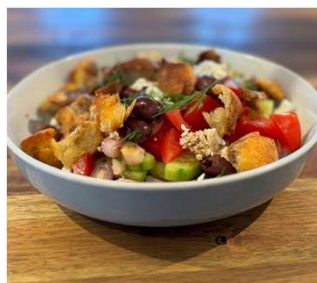
GRAND GREEK $24 Fresh chopped cucumber, tomato, shallot blended with olives, feta, dill and pan fried sour dough. Drizzled with balsamic vinegar.