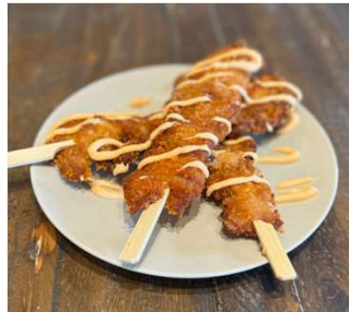
FRIED CHICKEN (3) $20

Locally sourced fresh tiger prawns. Pan fried in butter with garlic. Served with a drizzle of our house made Sweet Chili sauce