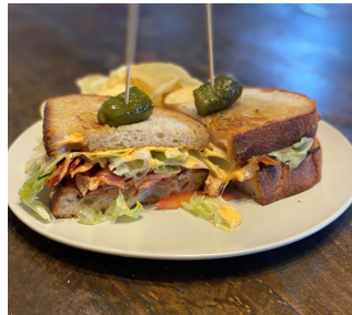
B.L.T. $25 Classic Bacon, Lettuce and Tomato in buttered toasted sourdough. Served with crisps and pickle.