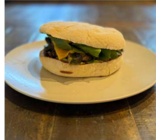
MEATLESS $22 Pan fried mushrooms, topped with cheese, fresh avocado, fried egg, spinach leaves and Chimichurri sauce