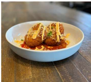
HONEY PUMPKIN $18

Filled with oven roasted pumpkin drizzled with honey. On a bed of our house made Arrabbiata sauce