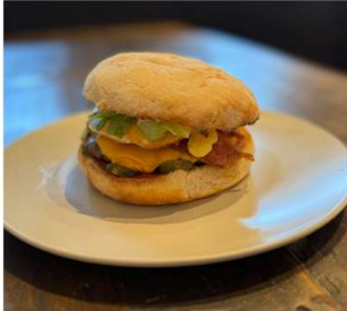
BEEF BURGER $22 Solid fresh 120g beef patty. Topped with cheese, bacon, fried egg, lettuce, pickle and tomato relish sauce