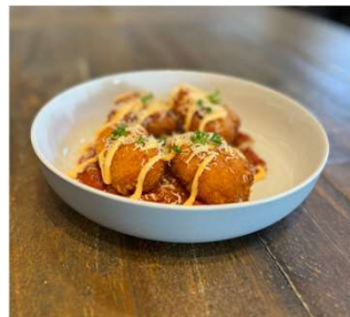
CREAMY MUSHROOM $18

Filled with pan fried bacon with a hint of maple syrup. On a bed of our house made Arrabbiata sauce