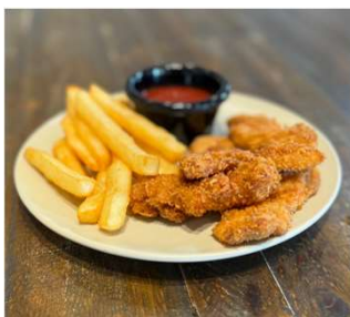
FRIED CHICKEN BITES $15

House made crispy fried chicken thigh. Served with fries and tomato dipping sauce.