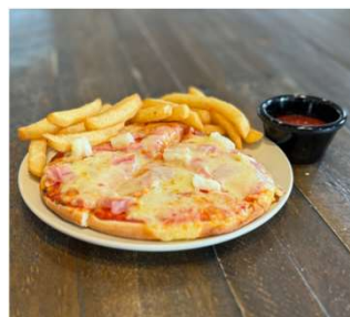
HAWAIIAN PIZZA $15

Beef patty, cheese, sauce on a bun. Served with fries and tomato dipping sauce.