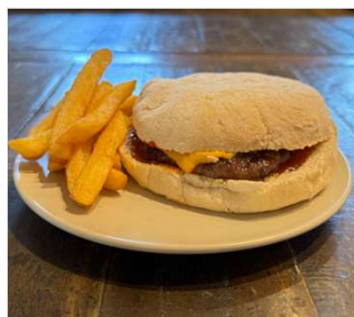
BEEF BURGER $15

House made crispy fried chicken thigh. Served with fries and tomato dipping sauce.