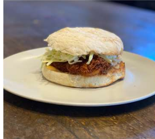
FRIED CHICKEN $22 House made crispy fried chicken topped with cheese, pickle, creamy coleslaw and spicy aioli sauce.